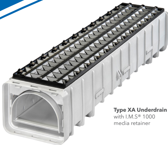
Type XA Underdrain with I.M.S. ® 1000 media retainer