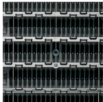
I.M.S. 200 media retainer